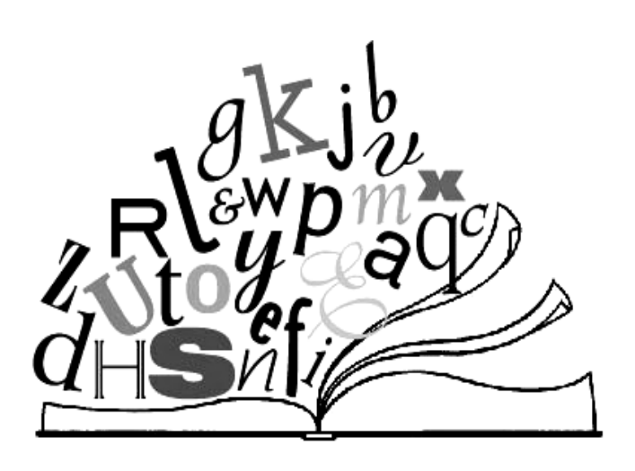
Commonwealth of Virginia Department of Education Richmond, Virginia 2004